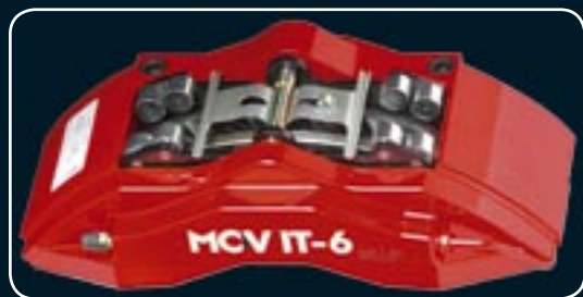
„anti-noise“ pads balanced weights for quiet braking