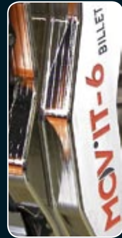
„anti-dirt“ design smooth edges - no dirt!