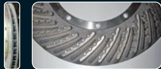
„dde“ cooling system larger surface for lower temperatures